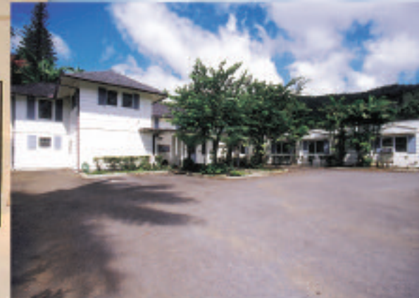
The Sister Maureen Keleher Center is undergoing a major renovation project to better serve patients and families.